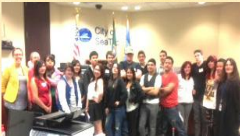
Judge Elizabeth Cordi-Bejarano (far right) pictured with students who participated in a mock trial during Law Week, 2013.

For more information on court services, schedules, and answers to frequently asked questions, visit the courts webpage at: http://www.ci.seatac.wa.us/index.aspx?page=130