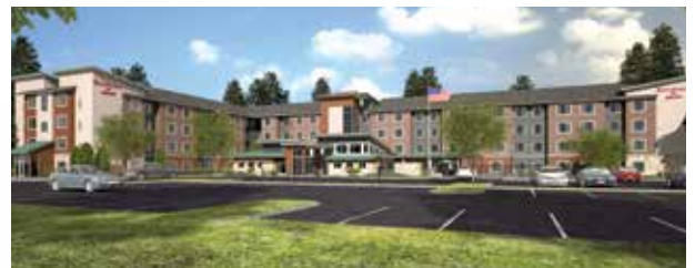
Architectural renderings of Hyatt Place (top) and Marriott Residence Inn (bottom), now under construction.