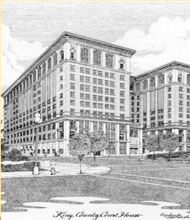
Illustration of King County Courthouse, Copyright © 1986, Richard Hashagen

I have met a lot of people employed here by the city and within the community that have been very supportive of the court and have encouraged our efforts. I enjoy my job very much and I wanted to take this time to thank you all for allowing me to serve as your judge.