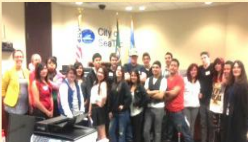
Judge Elizabeth Cordi-Bejarano (far right) pictured with students who participated in a mock trial during Law Week, 2013.

For more information on court services, schedules, and answers to frequently asked questions, visit the courts webpage at: http://www.ci.seatac.wa.us/index.aspx?page=130