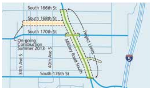
Above: Military Road S. Improvements

Street between 34th Avenue S. and Military Road S. The improvements include new sidewalks on both sides of the street, curb and gutters, drainage improvements, and pavement resurfacing. The City asks that drivers be aware that the roadway will be closed to through traffic and will be open to local access only.