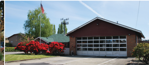
Fire Station 45 2929 South 200th Street