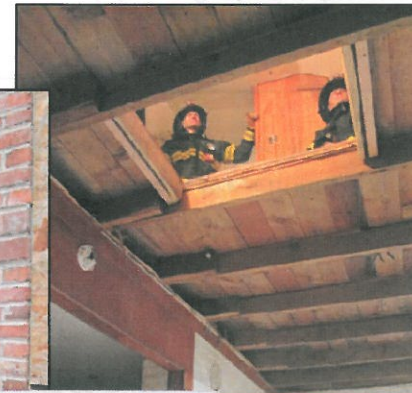
Pictures of Firefighter Survival Training & Emergency SCBA Operations