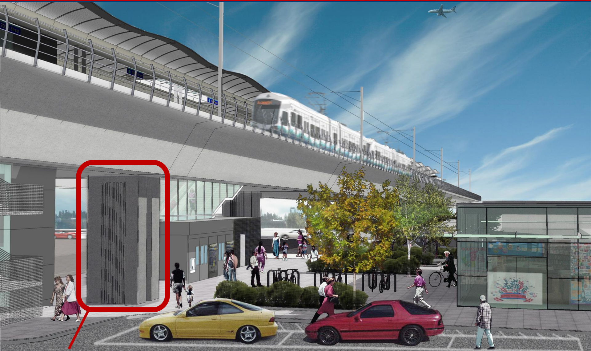
Art Project potential site

Community members and city staff on selection panel