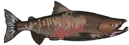
Chum salmon ( Oncorhynchus keta )