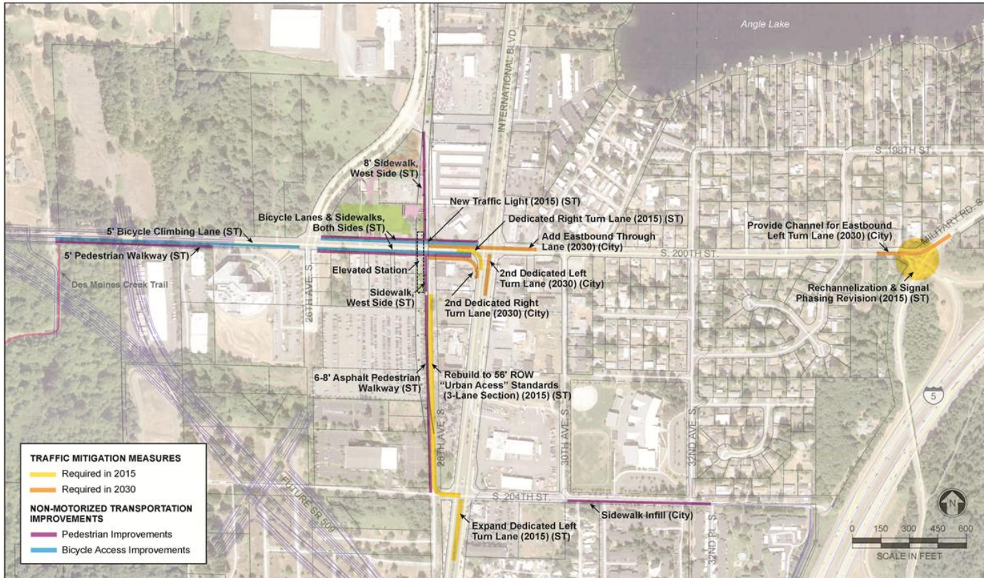
EXHIBIT F. Traffic Impact Mitigation Measures and Non-Motorized Transportation Improvements