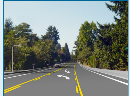
***The above images are for informational purposes only***

The City of SeaTac is currently designing street improvements along Military Road South from South 176th Street to South 166th Street. The improvements will be similar to the features constructed by the previous phase from South 186th Street to South 176th Street. The proposed improvements include new pavement, widening the roadway to provide two lanes, a two-way left turn lane, bicycle lanes, curb, gutter and sidewalks. In addition, illumination will be added and a new storm drainage system will be installed. The existing traffic signal at S 176th St will be modified and a new traffic signal will be added at S 170th St. Overhead utility lines will be relocated underground and poles will be removed. Highline Water District will replace their water main in conjunction with the project.