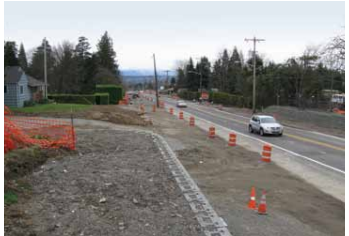
S. 154th Street Improvements project

The City appreciates the community's continued patience during construction of this project. Although the full road closure is complete, the City asks that drivers be aware that traffic delays are still expected throughout duration