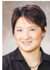
Mia Gregerson Deputy Mayor

1998–December 1999 and January 2010–December 2011.