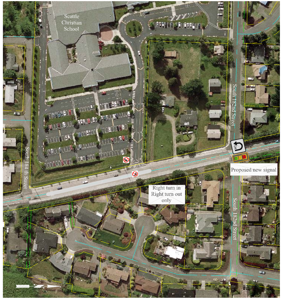
Option 2 - Signal At 182nd, Allow U-Turns