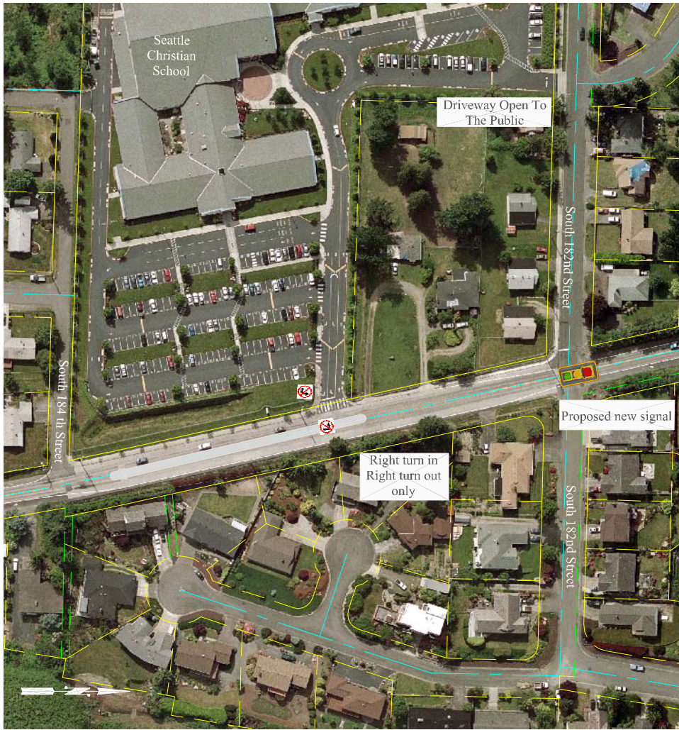
Option 1 - Signal 182nd & Open Driveway On 182nd