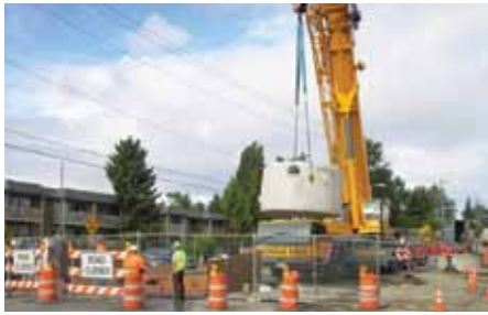
S. 154th Street Improvements project

R. W. Scott Construction Company is working to complete the City's road improvement project along S. 154th Street from 32nd Avenue S. to 24th Avenue S. The improvements include new concrete sidewalks, curbs and gutters, storm drainage facilities, turn lanes, bike lanes, and relocating overhead utilities to underground. Once complete, these