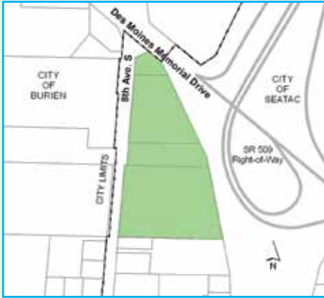
MAP AMENDMENT A-1