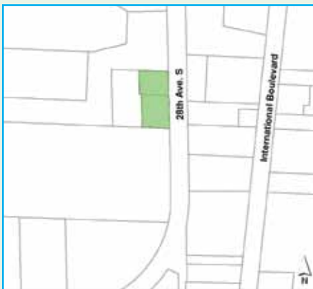
MAP AMENDMENT A-2