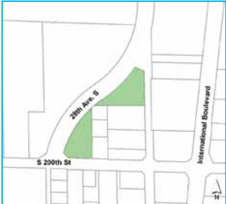
MAP AMENDMENT A-3