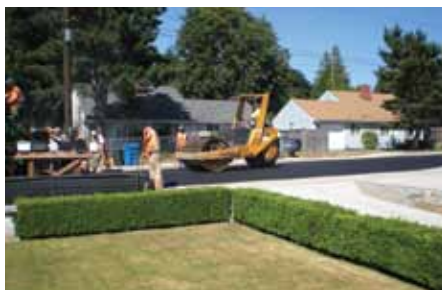
S. 138th Street Neighborhood Pedestrian Improvements

New sidewalks, curbs and storm drainage facilities were added to both sides of S. 138th Street between 24th Avenue S. and Military Road S. This project provides improved