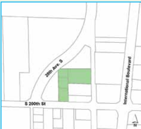
MAP AMENDMENT A-3.1