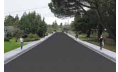
S. 138th Street Neighborhood Pedestrian Improvements