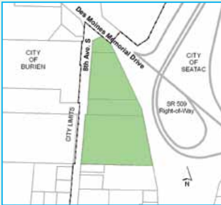
MAP AMENDMENT A-1