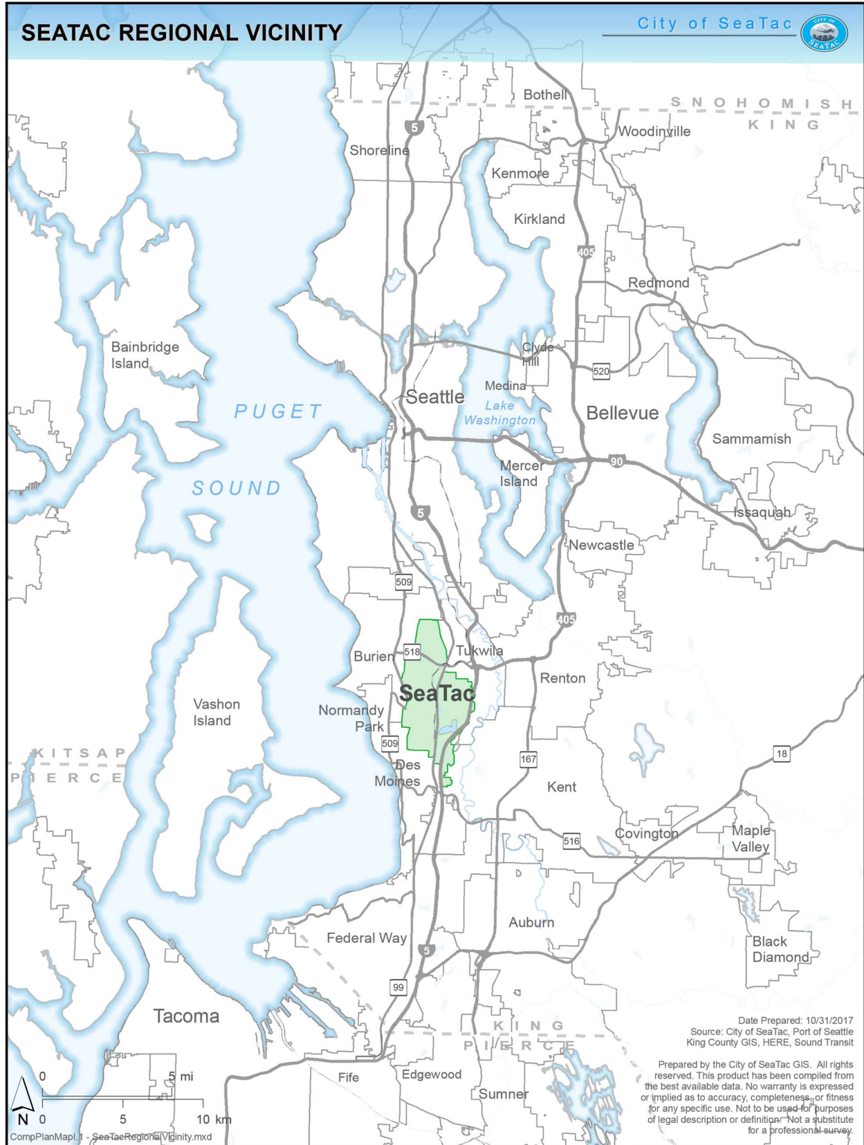
Map 1.1. Regional Vicinity