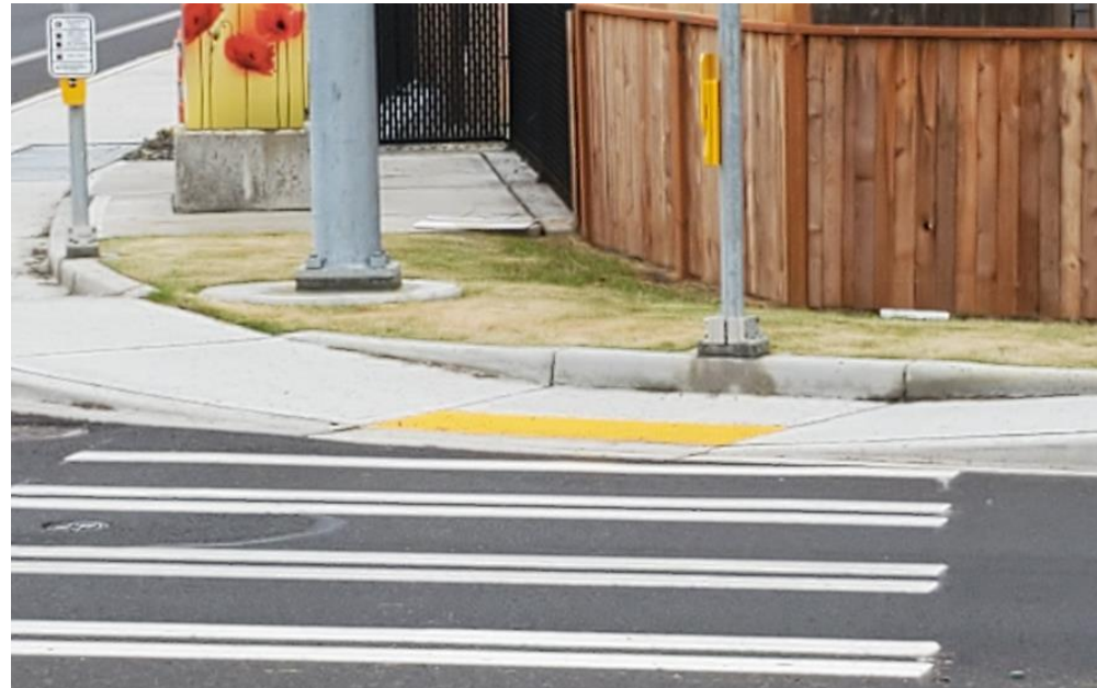
EXAMPLE OF PROPOSED IMPROVEMENTS