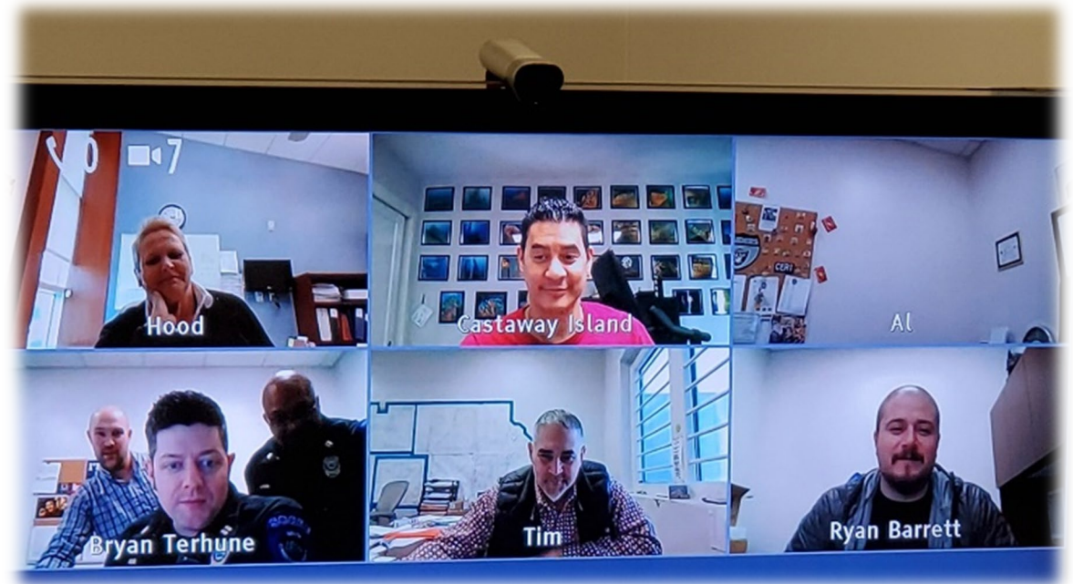
Early test of video technology – EOC remote participation