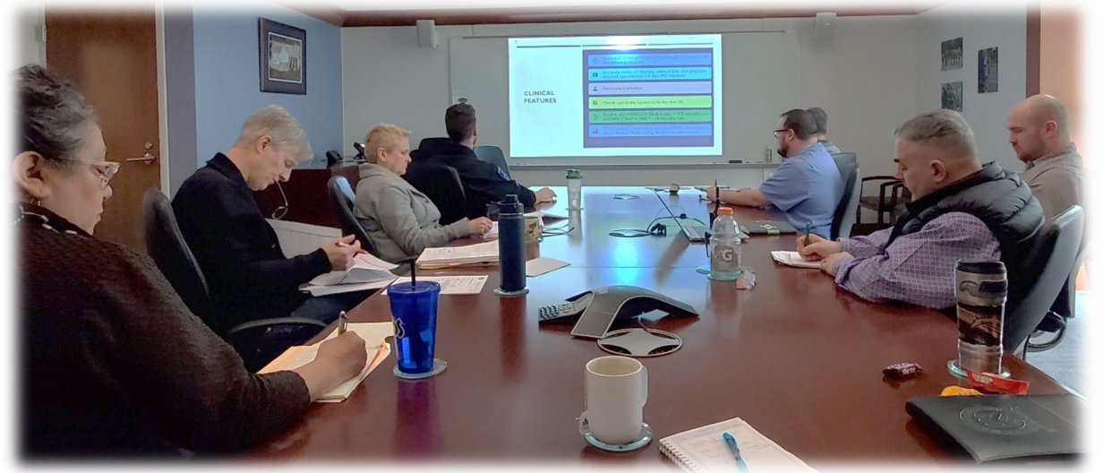
CDC pandemic training for corrections – March 2020