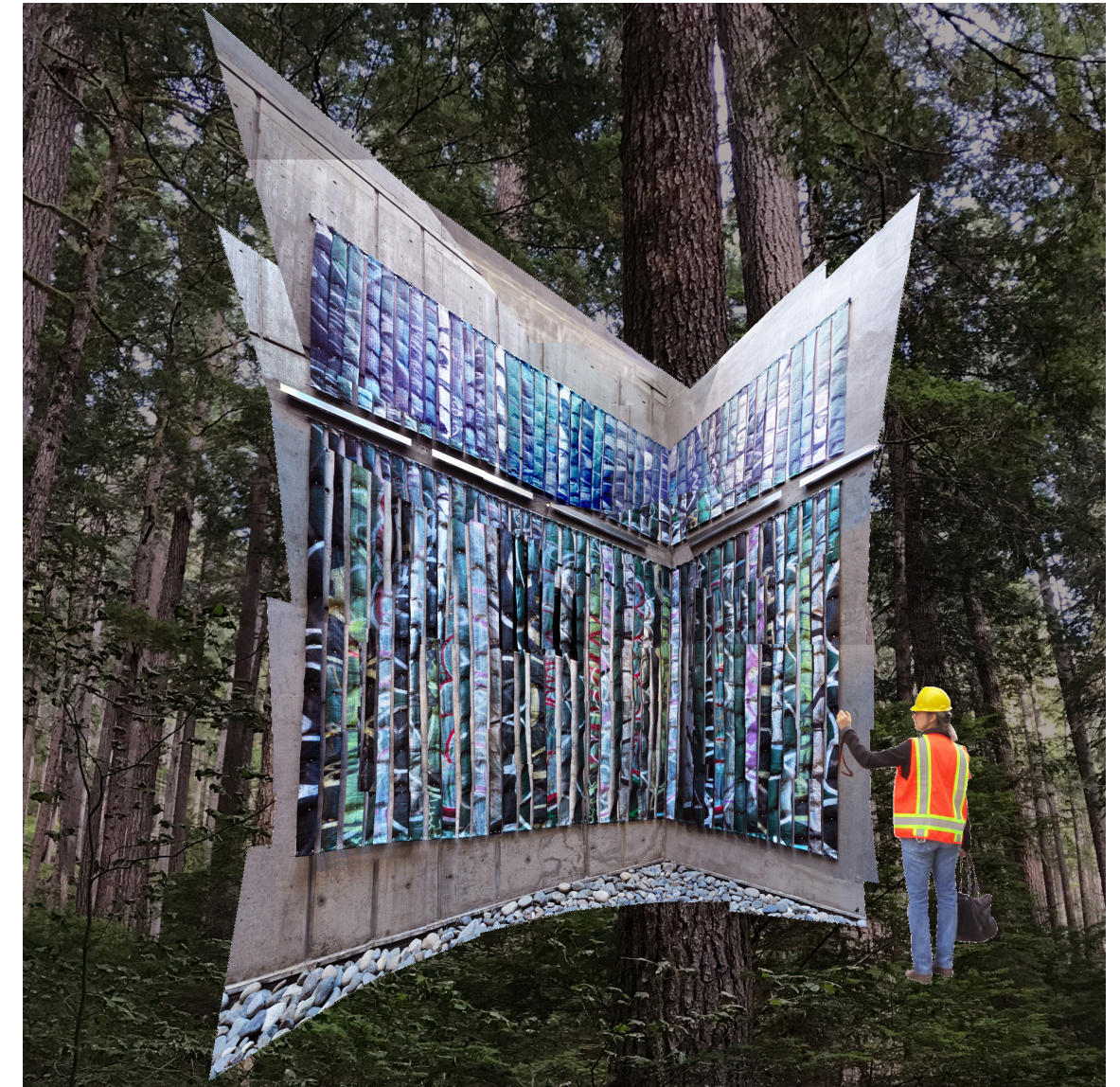
Forest Tapestry — 2013 Graffiti on polypropylene.

For the SeaTac Fence we propose painting 6-inch squares cut from salvaged polypropylene screening. The squares will be attached to the chainlink fence with galvanized wire. We have enough material to cover the 6-foot tall fence for 125-feet.