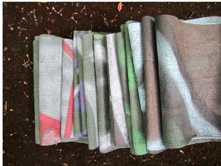
Samples of salvaged polypropylene screening with graffiti, cut into 6-inch wide strips.