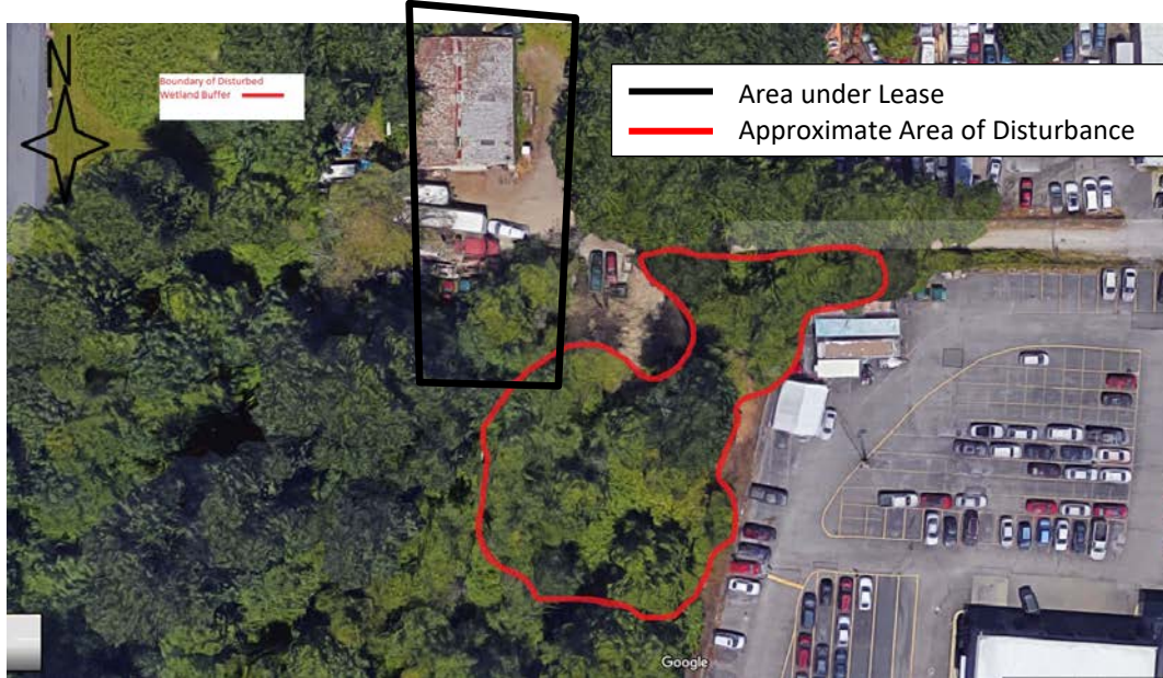
Figure 2: Buffer Disturbance initially observed (2018 imagery)

During the site visit WSDOT biologists observed mature deciduous trees had been knocked over and fill material had been spread across part of the property. Mature trees were also cut as biologists observed root stumps in the area of new fill. Wetland boundary flags from the past wetland delineation were observed bordering the edge of a new fill pad extension, tied to vegetation that had been pushed over and uprooted. Based on observations in 2018, we estimated that the lessee covered approximately 0.25 acres of buffer area. Figure 3 shows the area of disturbed buffer based on current 2020 imagery.