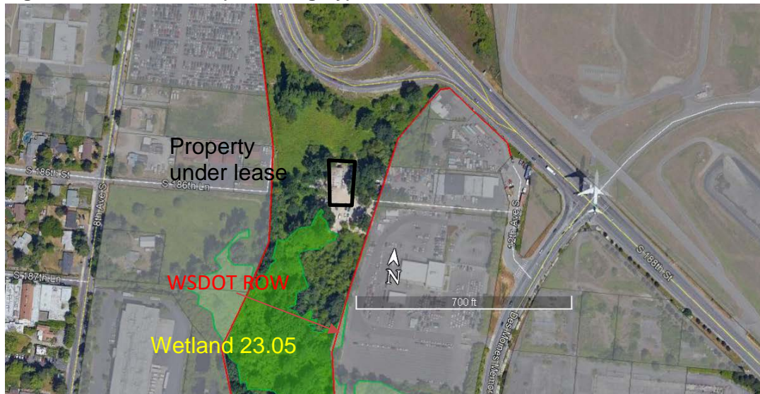
Figure 1: Wetland 23.05 (2020 imagery)

WSDOT initially purchased the property in 1975 as part of the future SR 509 Project. WSDOT leased the property back to the original owner (Foreman's Welding) until that lease was terminated in September 2016. In January, 2018 a new lease was executed with the current tenant, A-1 Right Towing for storage of impounded vehicles and operation of a towing business..