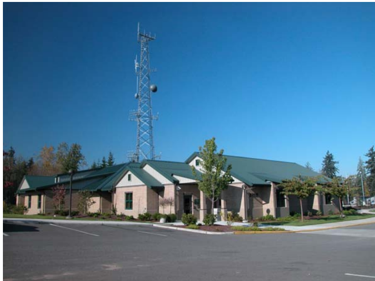
Valley Communications Center Kent, Washington