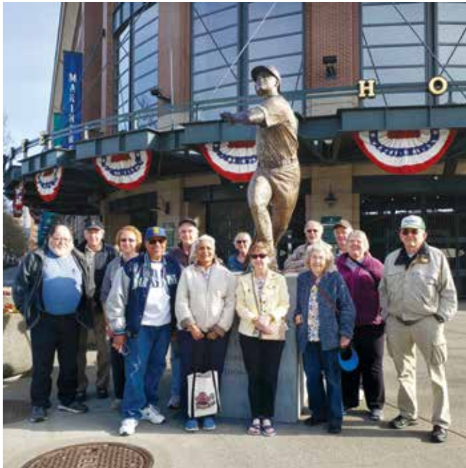
Senior trip to T-Mobile Park