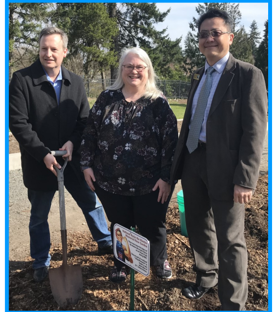
King County Councilmember Uptegrove, Mayor Sitterley, and Councilmember Kwon

The event included the placing of a Rosie the Riveter sign and the planting of a Rosie the Riveter rose to honor these women's service during WW II, and by extension the wartime service of everyone from that generation.