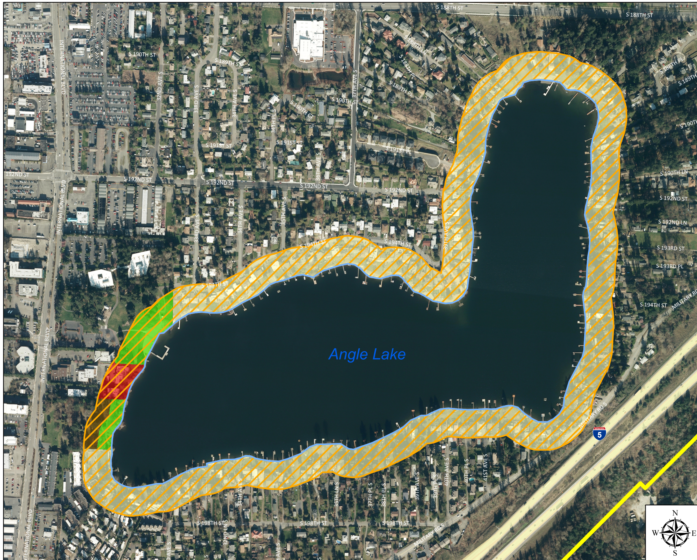
City of SeaTac FIGURE 1 Angle Lake Shoreline Master Program