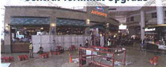
Central Terminal Upgrade