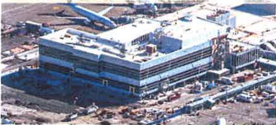
North Satellite Modernization