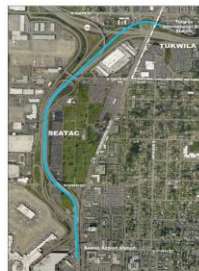
Area of work for City of SeaTac

Para información acerca del proyecto llame al: 1-800-823-9230 // 프로젝트에 관한 정보는 다음으로 연락하십시오: 1-800-823-9230 // Звоните 1-800-823-9230, чтобы получить информацию о проекте! // 如果您需要此信息請撥打中文 請撥打 1-800-823-9230