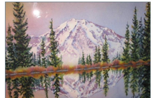
Purchase Award 2014 ~ Reflection Lake Artist: Roxana Caples