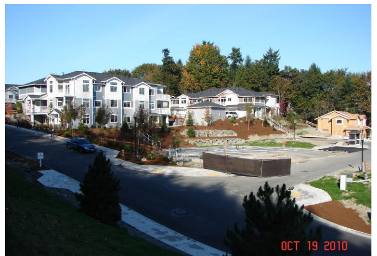
Figure 1 Polygon - Pod A

Update: Framing of all buildings completed. Painting of façade completed. Project sold to new developer (still unnamed) who will complete the project.