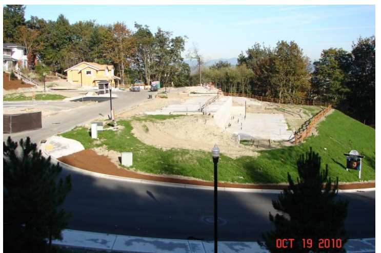
Figure 2 Polygon - Pod A