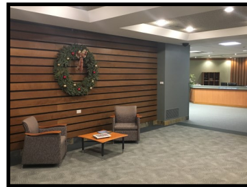
3rd Floor Reception