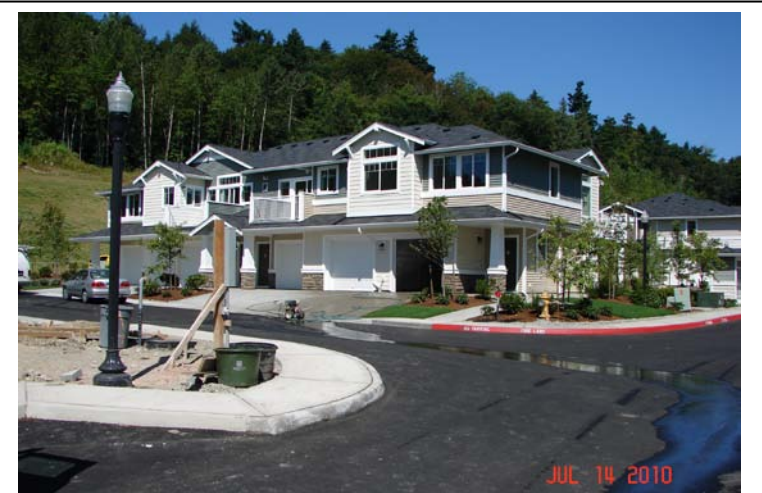
Figure 2 Polygon - Pod A