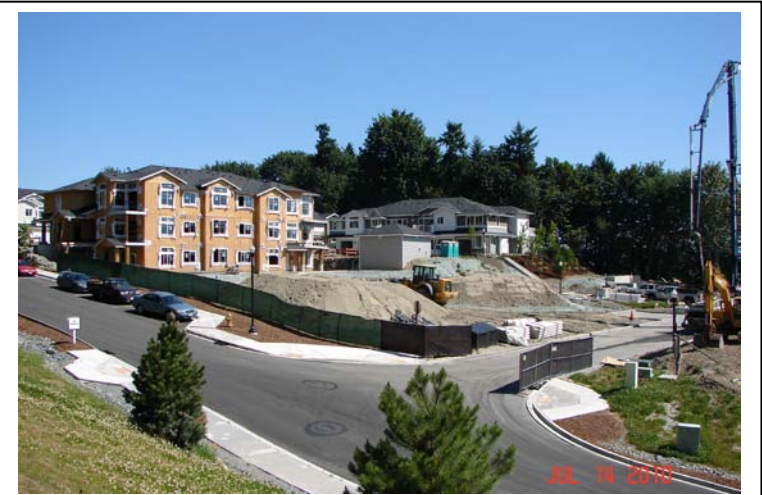
Figure 1 Polygon - Pod A

Update: The SEPA determination was appealed to the Hearing Examiner. The SEPA appeal hearing and public hearings on the preliminary plat and requested variance was conducted by the Hearing Examiner on 11/19/09. The SEPA appeal and variance request was denied by the HE. The preliminary plat was approved. The HE decision regarding the preliminary plat has been appealed to the City Council. The appeal has been dropped based upon the signing of a “Settlement Agreement”