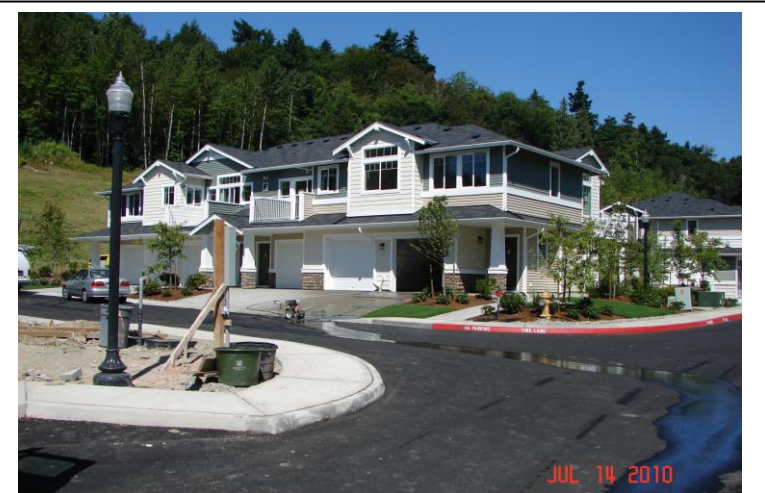
Figure 2 Polygon - Pod A