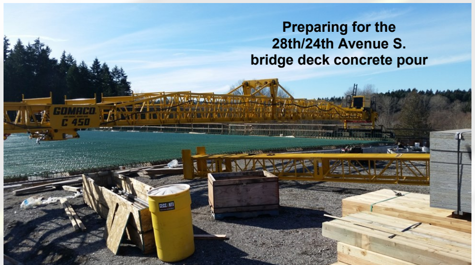
Preparing for the 28th/24th Avenue S. bridge deck concrete pour

Access will enable development of adjacent properties to the highest & best use.