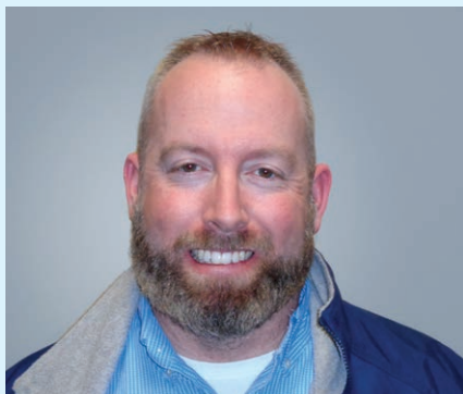
▲ THE DIVERSITY AWARD

determines the selection of the recipients for the Customer Service, Extra Mile, Diversity and The SeaTac Award. The awards were presented at the all City staff meeting and appreciation dinner on November 18 held at ACME Bowl. The awards given for service to the City of SeaTac and its residents in 2016 were: