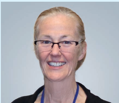
▲ CUSTOMER SERVICE AWARD