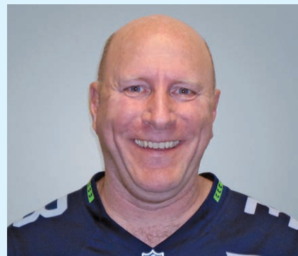
▲ THE SEATAC AWARD