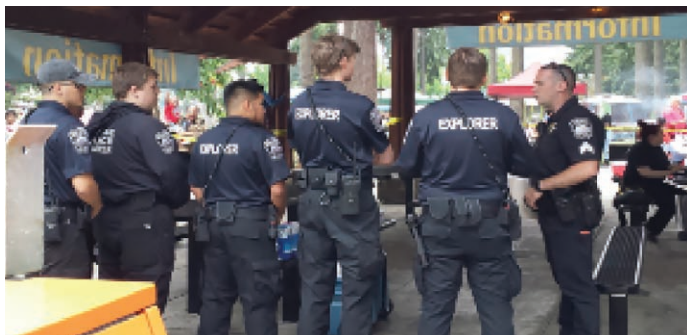
SeaTac Explorers are briefed before the July 4 Family Fireworks event at Angle Lake Park.

Roger McCracken re-appointed October 11, 2016