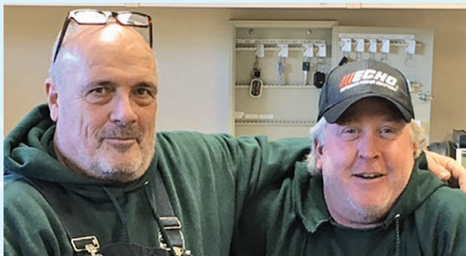
▲ EXTRA MILE AWARD