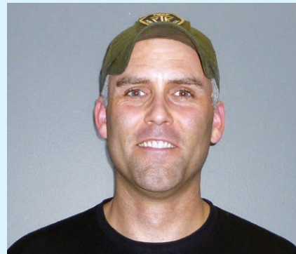
▲ OFFICER OF THE YEAR