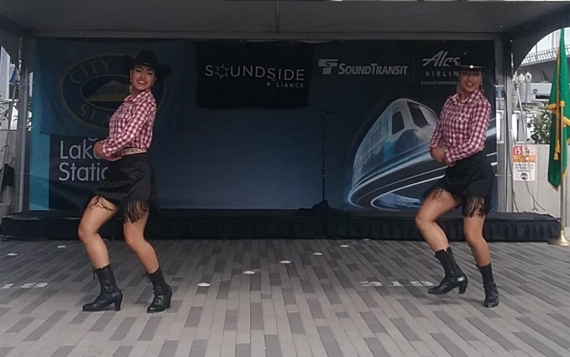
Photos from the Party on the Plaza Celebration at the new Angle Lake Station September 24, 2016