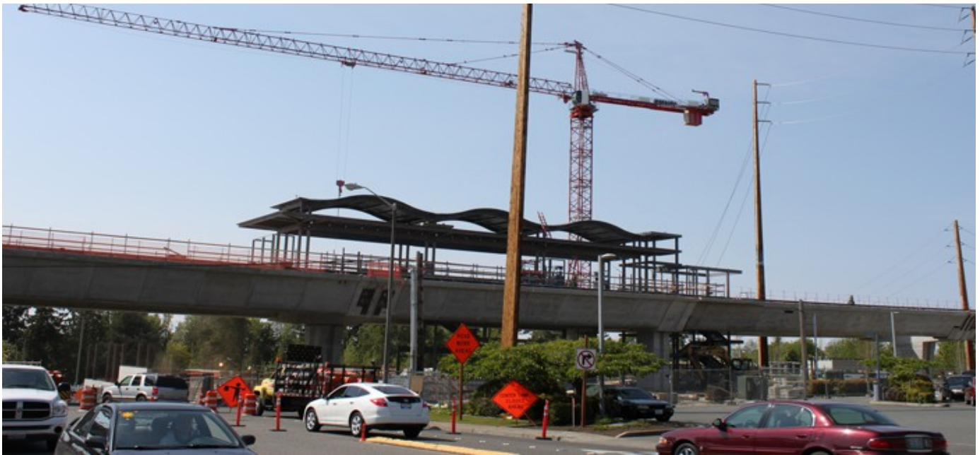
The Angle Lake light rail station under construction in SeaTac, WA. A recent workshop looked at the potential for new development around this and two other stations.

Posted on December 17, 2015 by Sean Geygan