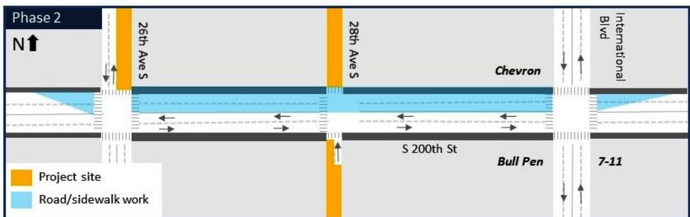
PHASE 2: Crews will then work on the north side of S 200th Street. Traffic will be shifted to the south.