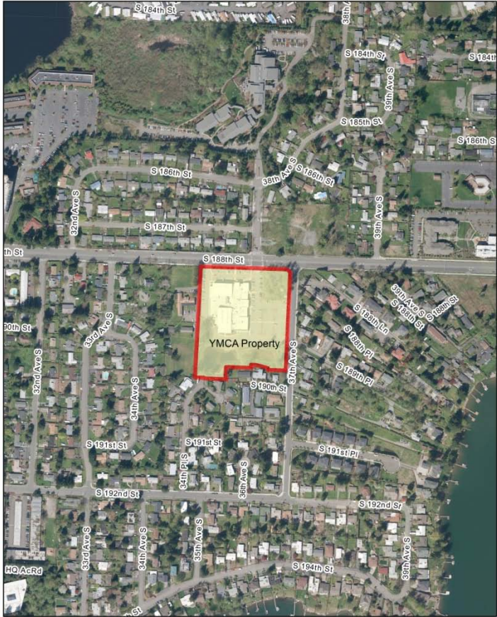
City of SeaTac Map Amendment 2

Map Amendment 2 – YMCA Proposal Amend land use designation from Residential Low Density To Office/Commercial/ Mixed Use