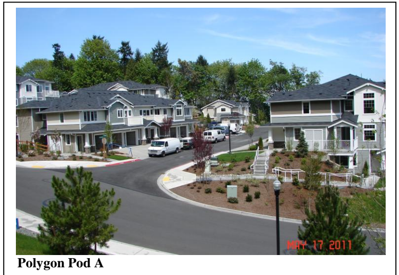
Polygon Pod A